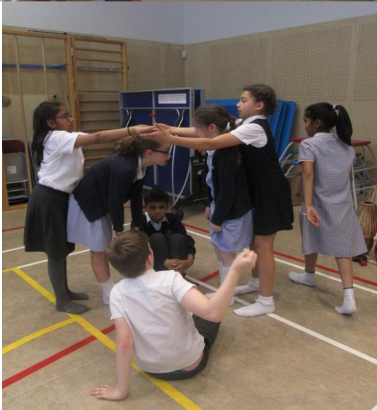
The teamwork activities helped the children to improve their listening and communication skills.