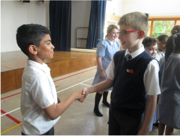
Warm up, getting to know each other games.